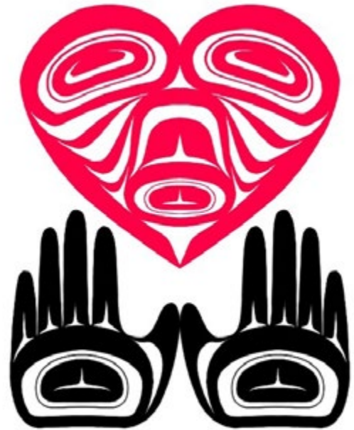
Winning youth logo design for upcoming Healing our Spirit Worldwide